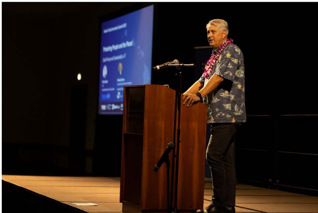
"PROTECTING PEOPLE & THE PLANET (DATA PRIVACY & SUSTAINABILITY IN IT)"

FEATURING: SERVCO, STATE OF HAWAII, IHS AUG 1, 2023 AT THE HAWAII CONVENTION CENTER