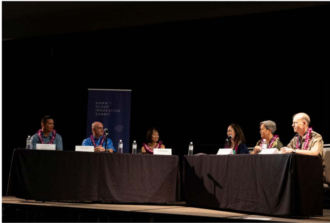
"THE ROLE OF HAWAII'S LEADERS IN DRIVING DIGITAL TRANSFORMATION" PANEL SESSION

TRUE COMMITTEE MEMBER ALAKAI EXECUTIVE SEARCH HIGHLIGHTS KEY RECRUITMENT METRICS